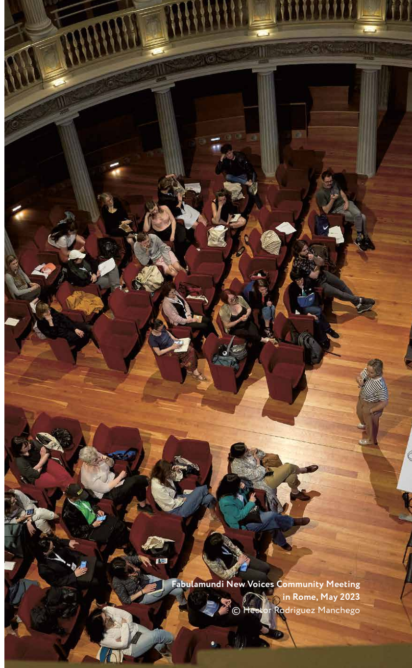
Fabulamundi New Voices Community Meeting in Rome, May 2023