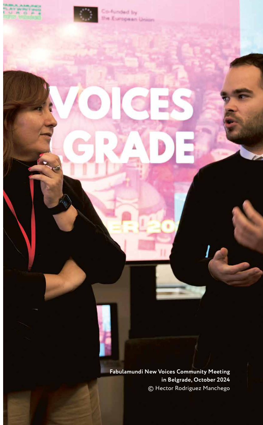
Fabulamundi New Voices Community Meeting in Belgrade, October 2024

youngest generation, they at least repay them with a fresh perspective, themes, and untried creativity.” – Barbora Schneidrová, Deník N