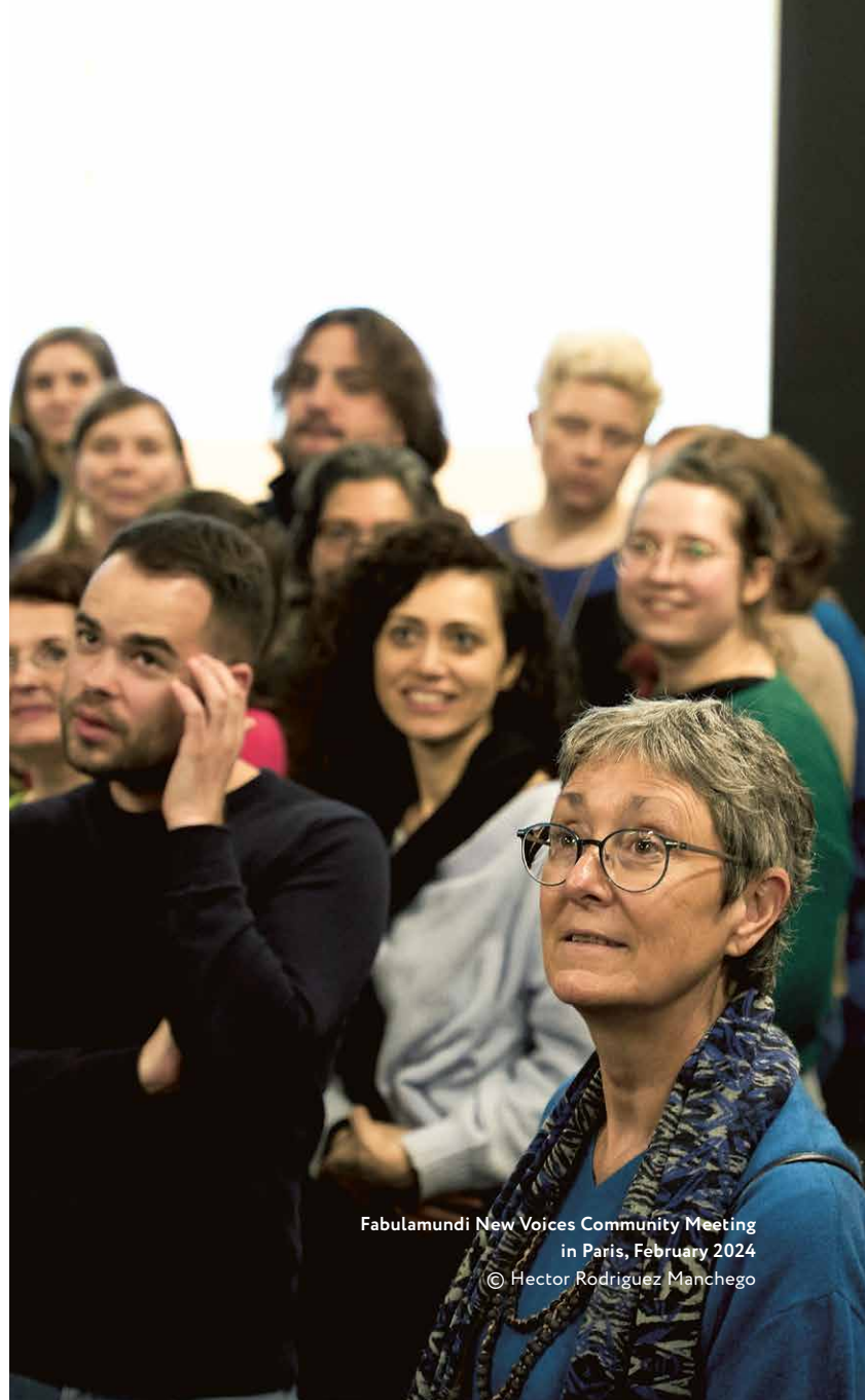
Fabulamundi New Voices Community Meeting in Paris, February 2024

The fund facilitates awareness-raising around contemporary challenges through testimonies, exchanges between artists and institutions, and provides support through financial aid, workspace loans, advice, and networking. FAAR initially raises private funds to serve as leverage for public financing. These four objectives also contribute to the development of new 'ethical dramaturgies,' addressing issues such as ecology, gender equality, ethnic diversity, and accessibility for disabled artists – both in artistic work and in how artists manage their companies.