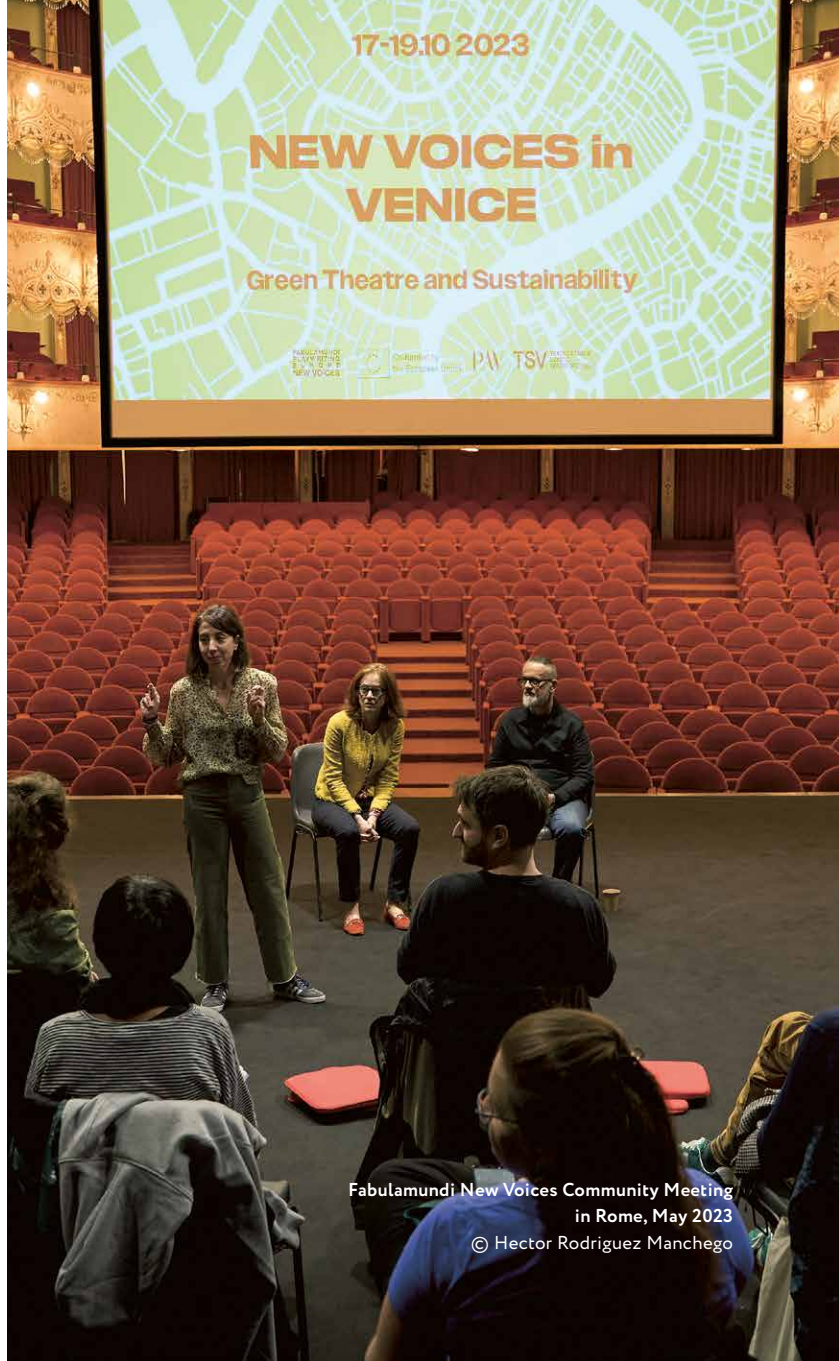
Fabulamundi New Voices Community Meeting in Rome, May 2023

To all the organisations, theatre-makers and partners who made Fabulamundi New Voices possible – thank you. A special thanks goes to the support received from the Creative Europe programme of the European Union for financing Fabulamundi New Voices. Let us continue to listen, collaborate, and keep imagining together.