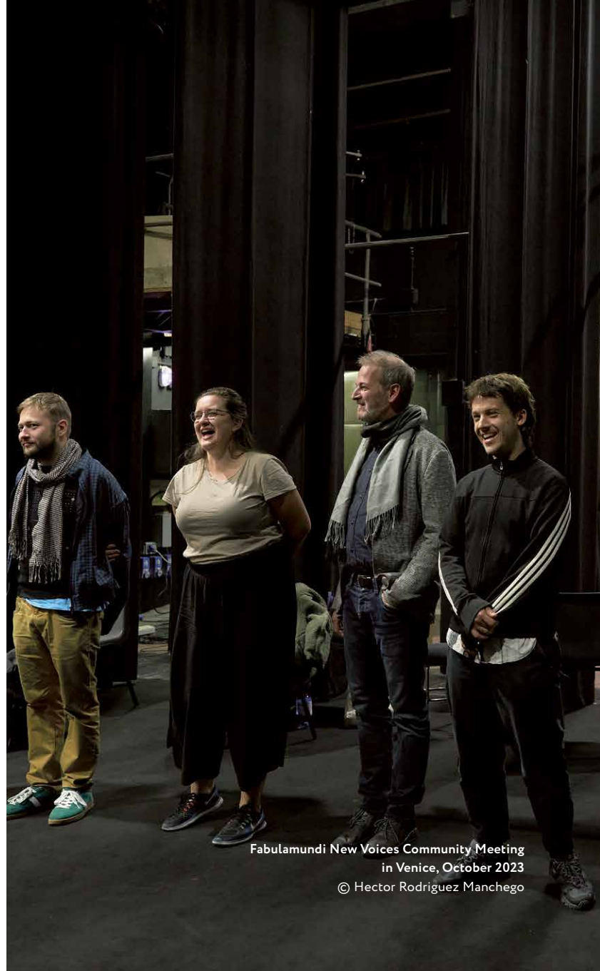
Fabulamundi New Voices Community Meeting in Venice, October 2023

protect our work with confidence and dignity — connecting with and learning from colleagues across Europe, and forming a new voice of a unified European stage that can reach audiences across the continent.